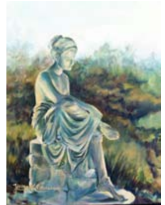
READY FOR THE DANCE acrylic on canvas