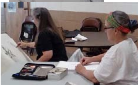
photographed by Hazel

Watch for an Eblast with more information!!!