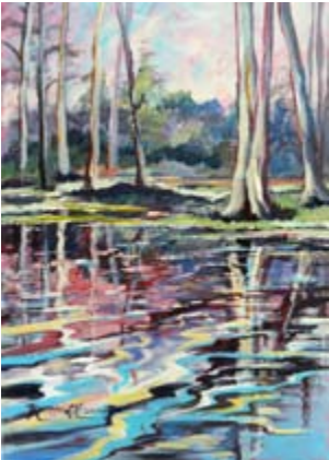
CYPRUS GARDEN REFLECTIONS acrylic on canvas

“As we mature we learn that our time spent in shadows is just as important as our time spent in the light. We can appreciate where we are, because of where we have been.”