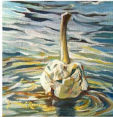
MOVING IN THE RIGHT DIRECTION acrylic on canvas