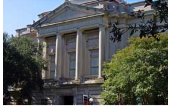
Photo Op of Rooftops from Queen Street Parking Garage-Bring Cameras/Walking Shoes